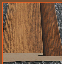
PLASTPRO PF™ FRAME with HydroShield Technology®